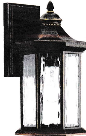
Item ID: 043004 Finish: Antique Bronze Width: 8.13" Height: 12.50" Length: 7.13"