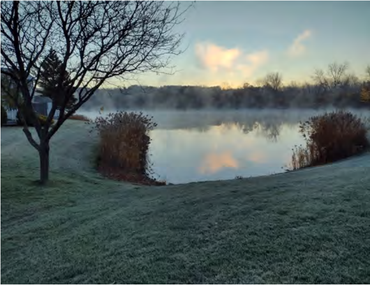
Mist on the Lake