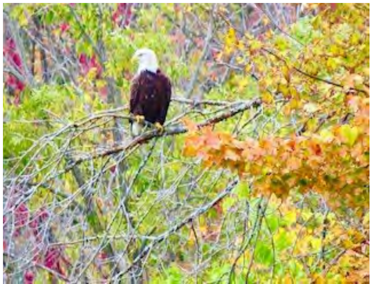
Eagle on the Path